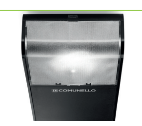
Built-in led courtesy light. Set for remote cable release.